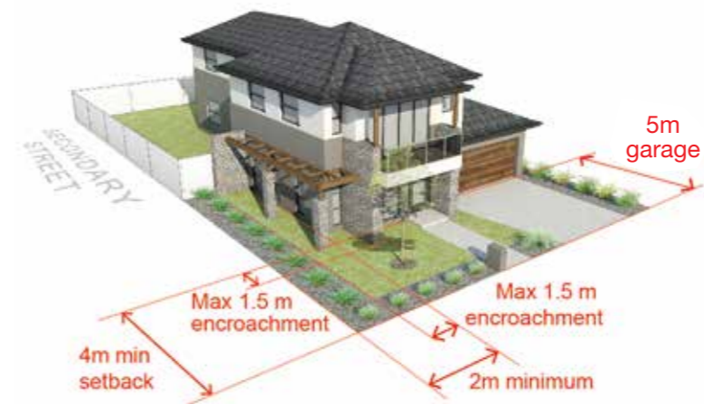
Diagram 03: Corner Lots

Appropriate corner lot façade features will be assessed on a case-by-case basis by the DAP.