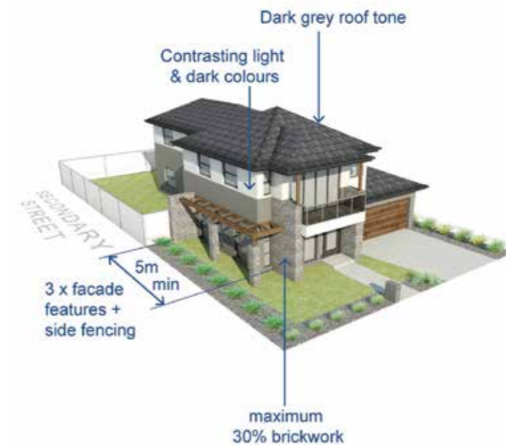
Diagram 04: Building Materials