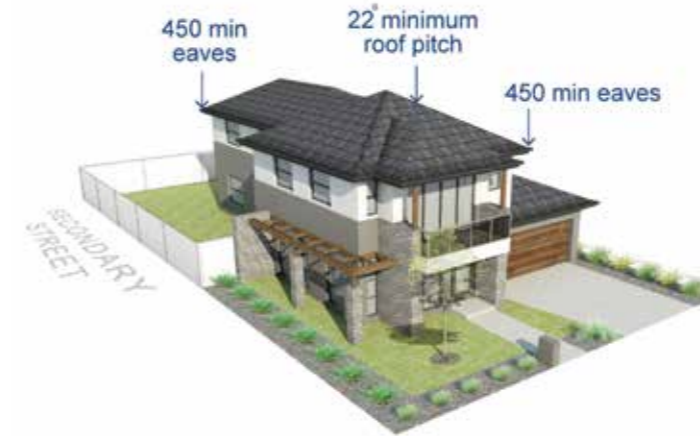
Diagram 02: Roof design